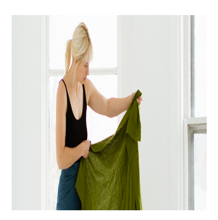
You Are Doing Enough